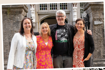
The Festival Founders